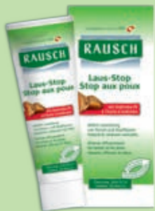
RAUSCH Lice Stop